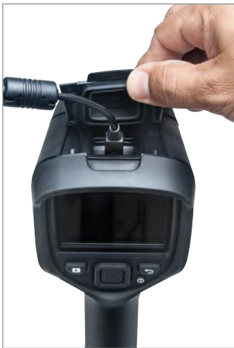
Download images fast via USB

Specifications are subject to change without notice. For the most up-to-date specifications, go to www.flir.com