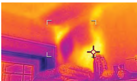
See temperature patterns showing insulation voids and other building issues