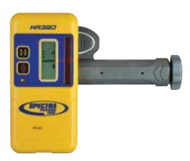
HR320 Receiver and C59 rod clamp included with every package