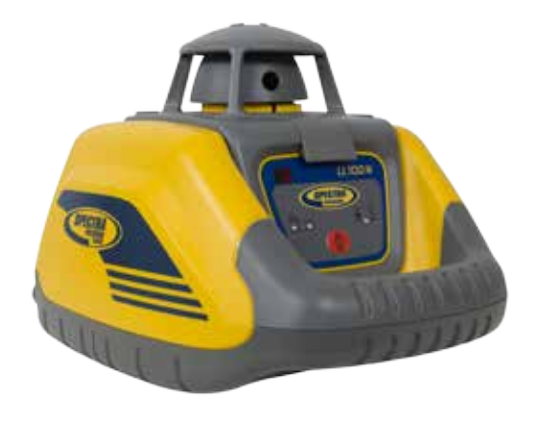
LL100N features a removable rotor cage for full 360° coverage