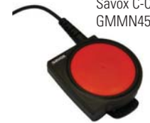
Savox C-C400 GMMN4579A

Complete the solution with the Savox C-C400 com-control unit that enables the use of your two-way radio in hazardous conditions. Designed to be especially robust for the most extreme environments, the extra-large push-to-talk button ensures transmission even when used underneath gear and protective clothing.