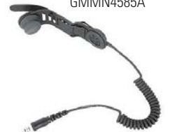
Savox HC-1 GMMN4585A

Complete the solution with the Savox C-C400 com-control unit that enables the use of your two-way radio in hazardous conditions. Designed to be especially robust for the most extreme environments, the extra-large push-to-talk button ensures transmission even when used underneath gear and protective clothing.