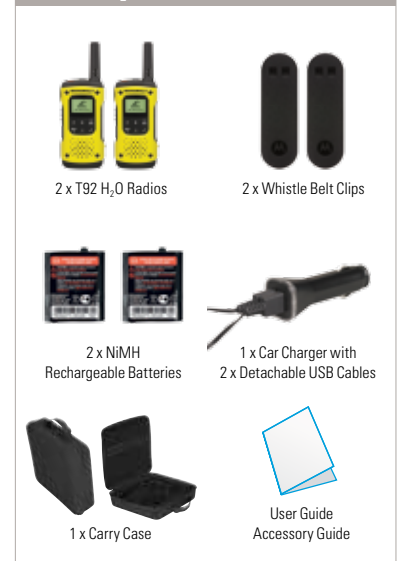
2 x T92 H 2 O Radios